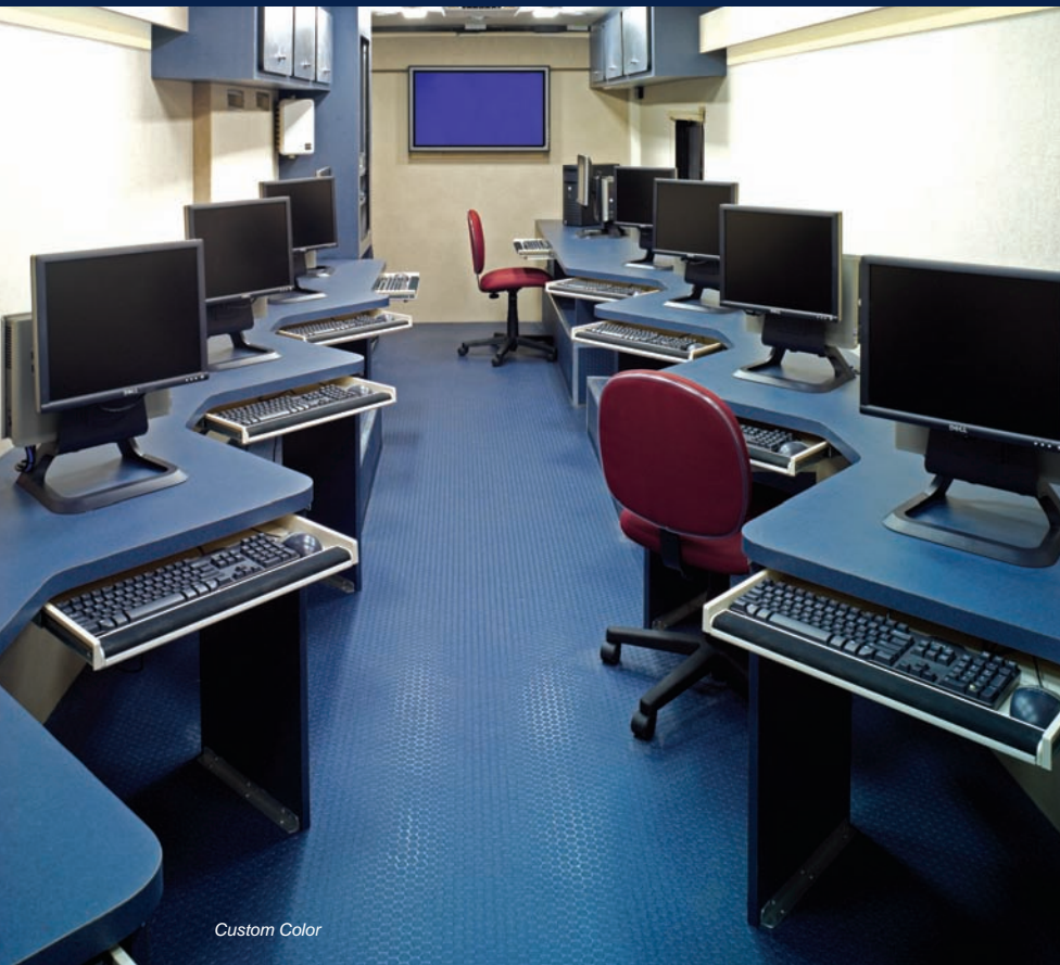
C150 (6') C8150 (8') Onyx*