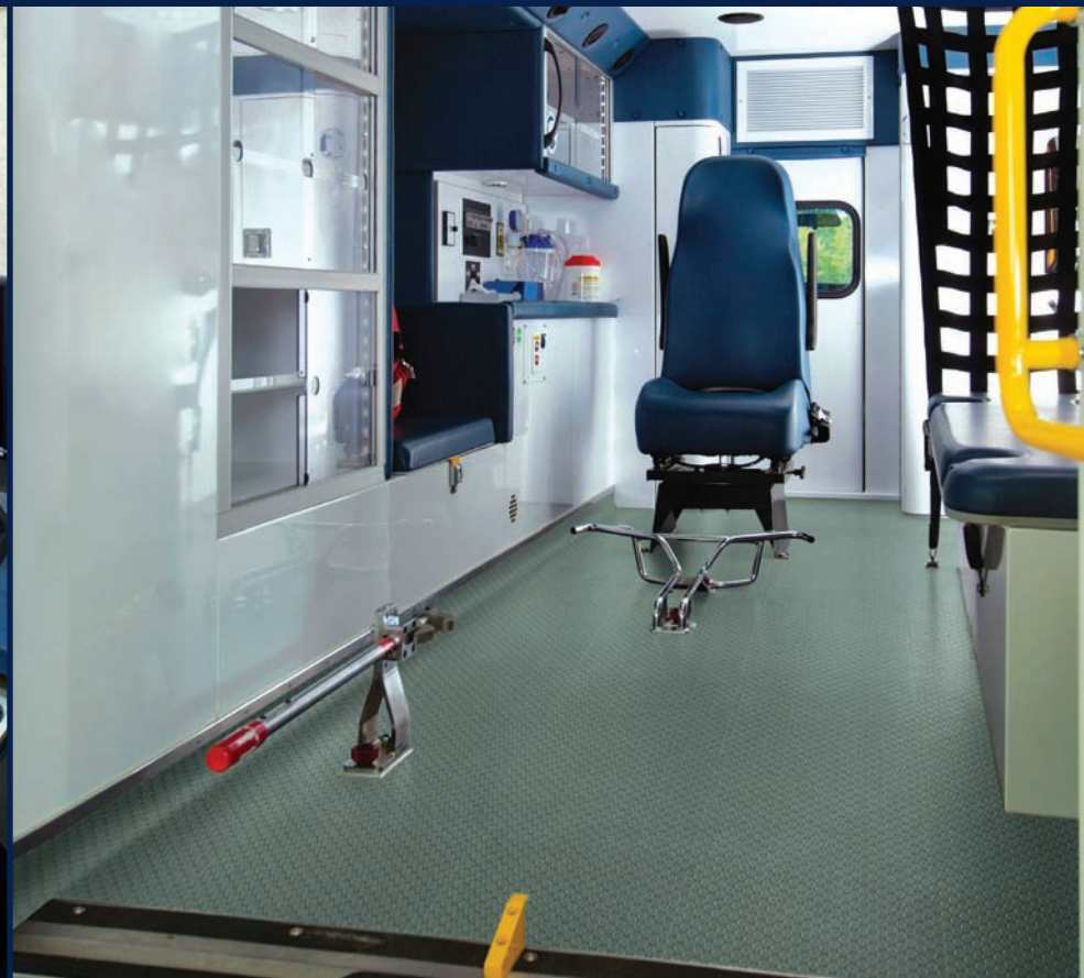
C152 (6') C8152 (8') Sapphire*