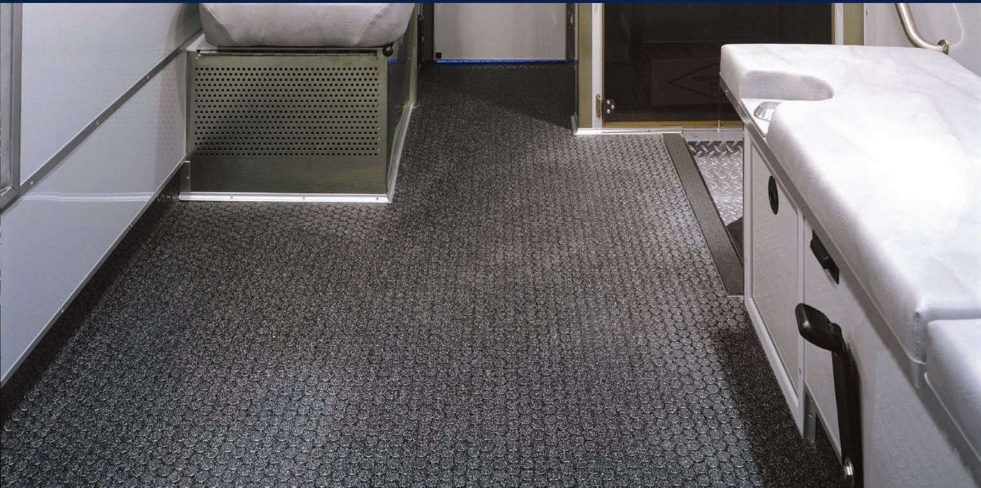
C150TS Onyx Topseal